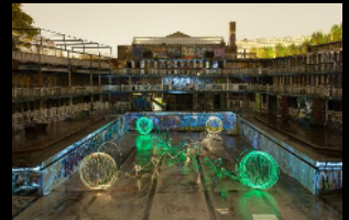
Live Composite & Light Painting