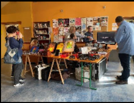
Stand of Stéréo-Club Français