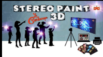
Stereo Paint 3D